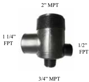
COMBINATION TANK ADAPT