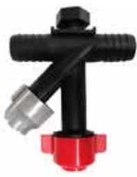
NO DRIP NOZZLE FITTINGS