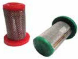
NOZZLE STRAINERS POLYPRO BODY ST. STEEL SCREENS