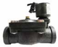
12V VALVE NYLON BODY, SANTO DIAPHRAGM, VITON "O" RINGS, 150 PSI MAX