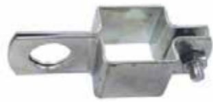
BOOM CLAMPS, STEEL