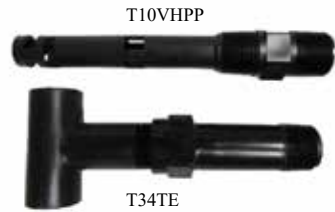
AGITATOR & TEE